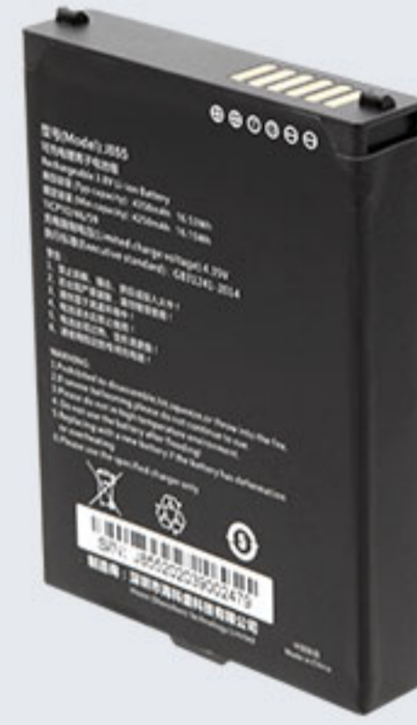
BTRY-C60-43MA 4350mAh Li-ion battery, 3.8V output