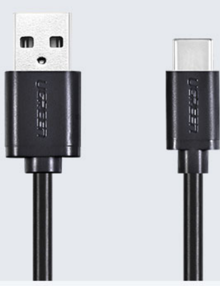
DC-BK-TypeC 1.0 meter Type-C cable