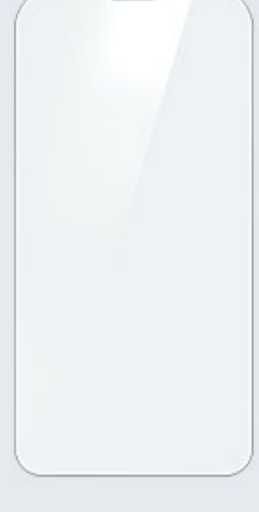
SP-C60 Tempered glass screen protector